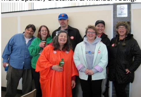
They're smiling & ready to GO....