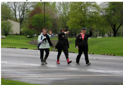
Still smiling..... Still walking.....