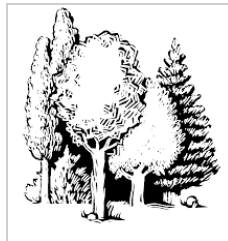
Grove of Grace