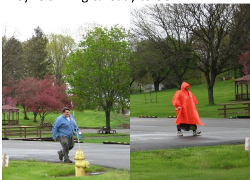
And away they GO.....