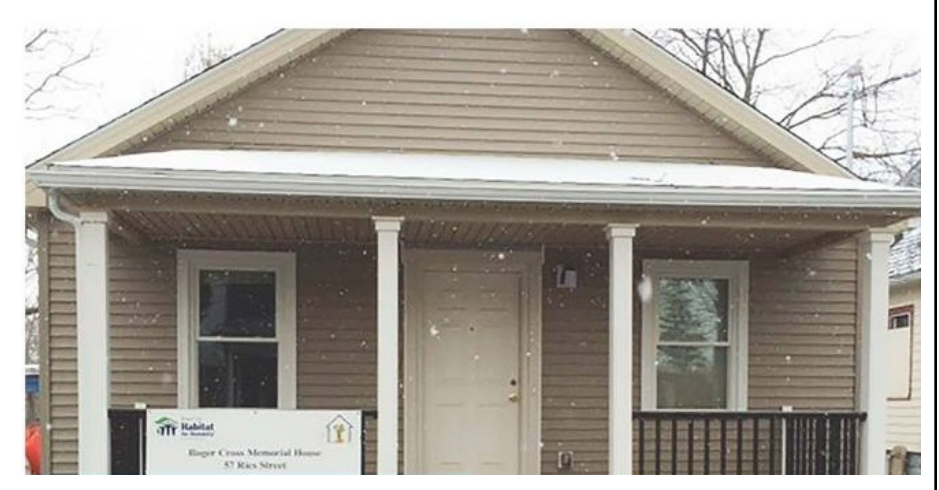
57 Ries Street