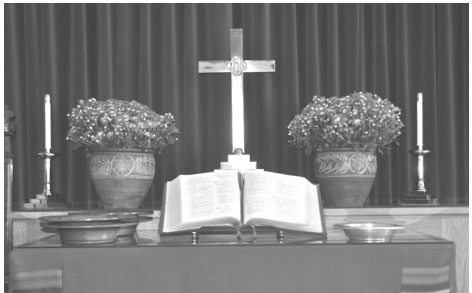
More than a month has passed since this altar was set for the Sept. 20 bi-centennial celebration