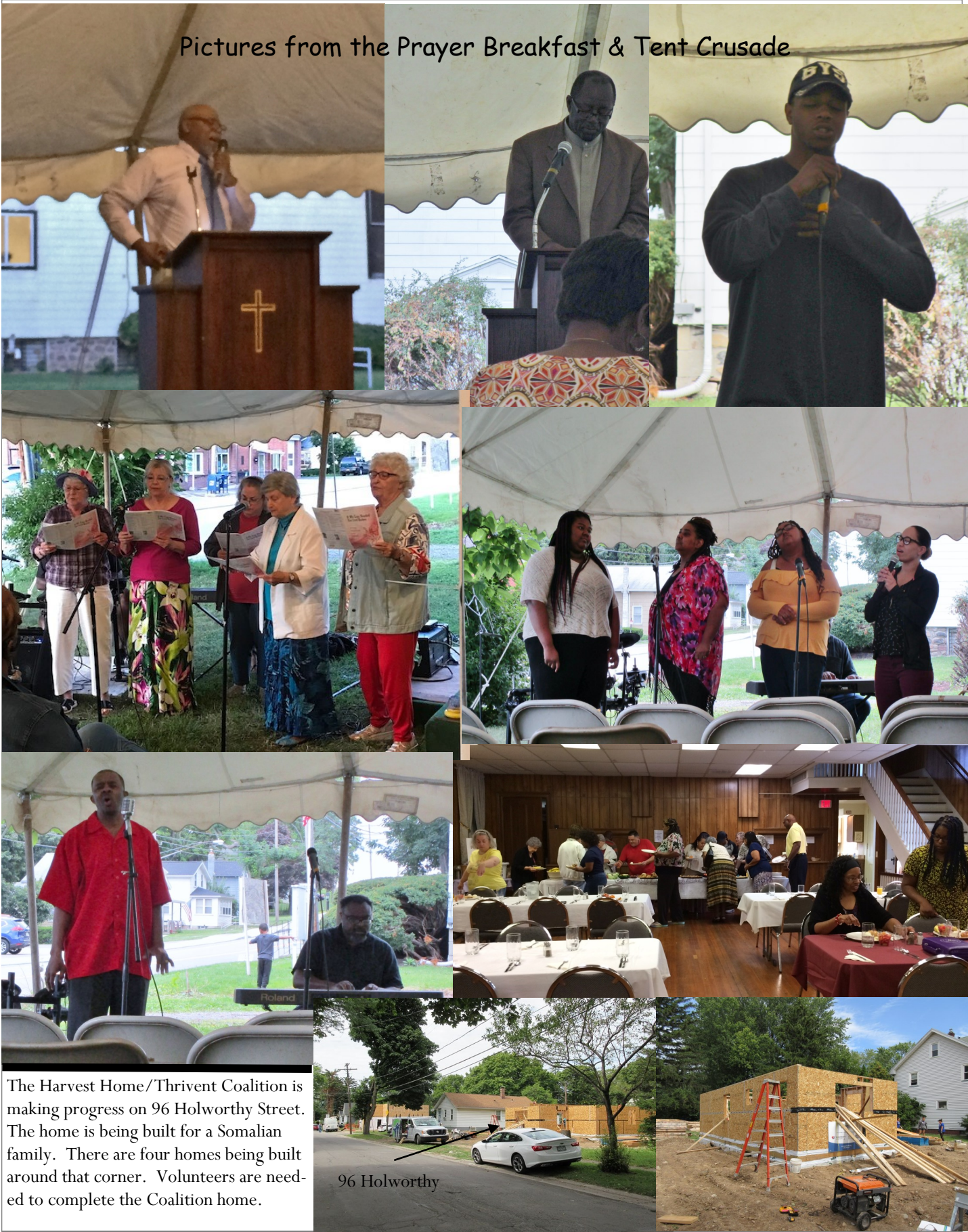
The Harvest Home/Thrivent Coalition is making progress on 96 Holworthy Street. The home is being built for a Somalian family. There are four homes being built around that corner. Volunteers are needed to complete the Coalition home.